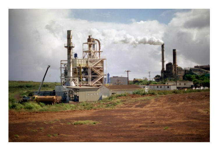
Figure 1. Biomass gasifier in Paia, Maui, Hawaii. This facility operated for a time in the 1990's and used sugarcane bagasse as fuel.

The financial viability of the Taylor gasification enterprise is revealed by some of the very assessments that DOE requires for the loan guarantee evaluation process, including a credit risk assessment by Standard and Poor's. The S&P report was not good news for the project, listing only four strengths, but eight weaknesses, and ultimately giving the project a "ccc" rating meaning that it is " currently vulnerable and dependent on favorable business, financial and economic conditions to meet financial commitments. "<sup>15</sup> The report observed that Taylor's power purchase agreement compels the plant to generate more energy each year, with a requirement that the plant be available 85% of the time in year 3, and 92% of the time in years 4 and 5. The report states, "given the technology, this availability requirement is a significant credit risk", although it also observes that the plant does have the option of burning natural gas to ensure that power generation is uninterrupted.