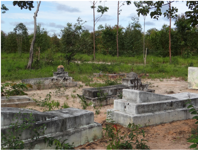
Photograph 12: Cemetery fenced by eucalyptus plantation, municipality of Urbano Santos. Ivonete Gonçalves de Souza

mile after mile, a monotonous monoculture with which other plants and animals cannot coexist. The people and animals in the area have no use for the vast tracts of monoculture plantations, which provide no fruit or other kind of sustenance. The eucalyptus tree has nothing to teach us about the secrets of the Cerrado of Baixo Parnaíba or the native people who form part of its diversity. Native people enrich and fertilise the land throughout their entire lives, from the day they are born until their bodies are returned to their place of origin, in cemeteries that are now regularly covered by eucalyptus trees (Photographs 12). Baixo Parnaíba is a