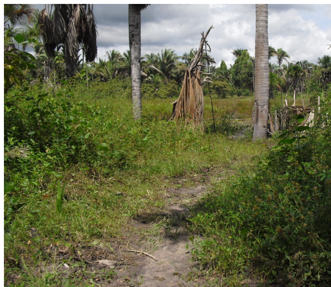
Photograph 2: Stream with reduced flow due to the impact of a eucalyptus plantation, community of Coceira.

Land appropriations are opportunities for landowners, including soybean farmers and other businesses, to either immediately convert and use the land they have acquired and evict the families who live on it, or to initially exploit the communities. Former residents of affected communities describe how new land owners, including Paineiras (Suzano), took a proportion of their harvests as payment for the use of their land, even before the company started planting eucalyptus. The residents found themselves as tenants. One resident of Pólo de Coceira describes how rigid Paineiras was in taxing harvests, to the extent that representatives of the company would visit farmers' fields and mark out which proportion of the produce “belonged to them”.