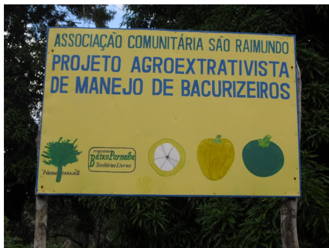
Photograph 20: Community agricultural project in São Raimundo. Winnie Overbeek

“...out of the apparent inevitability of the situation, those who are supposed to disappear instead react and fight back. They pick themselves up and assert their existence, their rights and their will to continue to be what is principally an inconvenience to them [Suzano]. They change the course of the inevitable. Staying connected to their roots, like old Moriche palms, they reach for the sky, challenge the ways of the world, and confront the supposedly unquestionable logic of development and progress and say: “here we