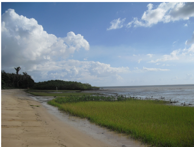
Photograph 16: Area where Suzano wants to build new port facilities for exporting wood pellets, São Luis.

Recent news about Suzano will not be in the least encouraging for their shareholders, with the media reporting that the company is in financial crisis. Suzano plans to open a new pulp mill in Imperatriz, Maranhão, by the end of the year, but the estimated US$3 billion required to finance the plant has left the company in debt and has forced it to drastically reduce spending. [29] In March 2013 Suzano decided to suspend the construction of a pellet plant that would process eucalyptus planted in Baixo Parnaíba. The plant was to be built by its subsidiary “Suzano Energia Renovável” (Suzano Renewable Energy) in the municipality of Chapadinha. [30] The plan had been to open the plant in 2014 but currently there is no anticipated time-scale for completion and construction has not yet started. There are also plans for new port facilities in the area, in a beautiful coastal region of Maranhão (Photograph 16), but hundreds of families are opposed to the idea because they would have to leave their land for it. On top of this, company workers in the municipality of Urbano Santos