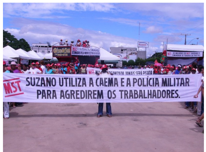
Photograph 17: Protest against Suzano in Teixeira de Freitas, Bahia.