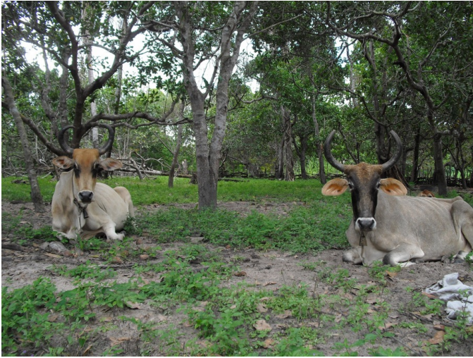
Photograph 3: Cattle in the community of Coceira. Winnie Overbeek