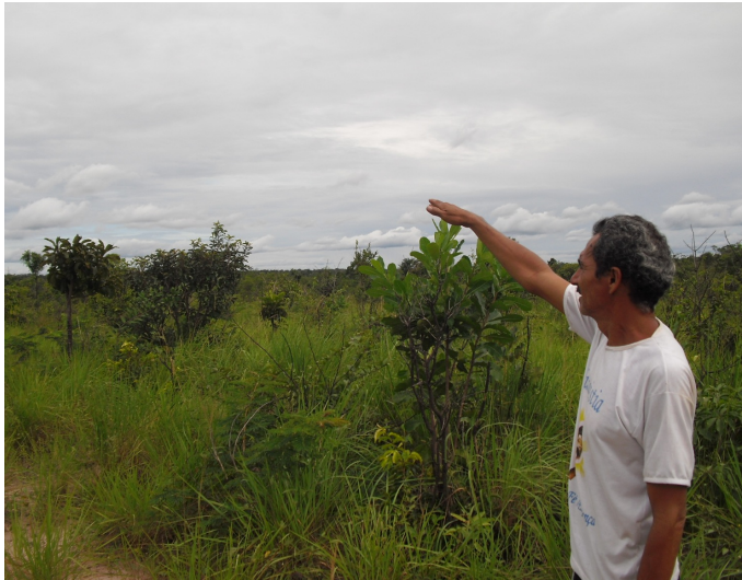
Photograph 7: Area where Suzano started clearing, community of Coceira.

One resident said: “Suzano wants to remove us from here, and leave us with fewer possessions.” On 17th May 2011 the company tried to clear an area of Cerrado close to the community, on land that formed part of an Area of Environmental Protection (Área de Proteção Ambiental, APA) called Upaon Açu. [23] The community told the tractor operators to stop their work: “We stayed in front of the tractors from half past two in the afternoon to half past six at night.” According to the residents, one of