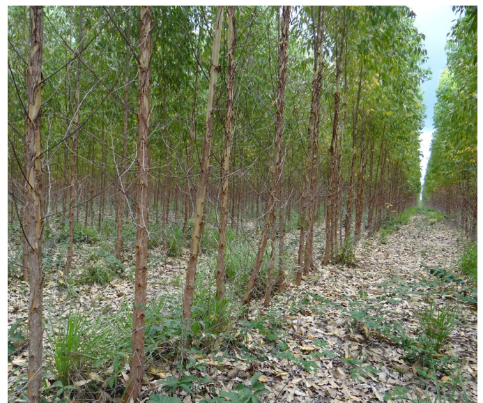
Photographs 13 & 14: Suzano's dense eucalyptus plantations specifically for biomass, municipality of Urbano Santos. Ivonete Gonçalves de Souza