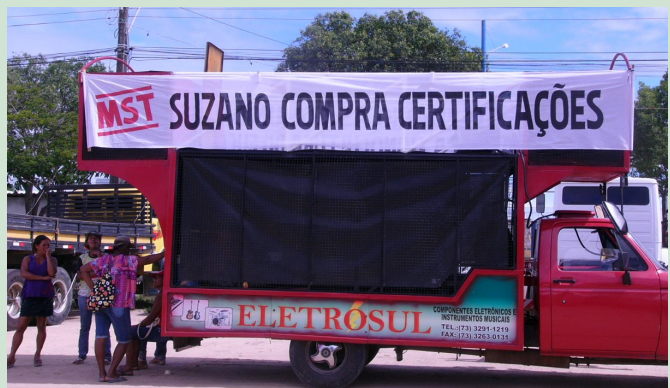
Photograph 11: Protest against Suzano in Teixeira de Freitas, Bahia. Banner reads: “Suzano buys certifications”.

The minimum that should be expected from the FSC is a refusal to certify Suzano's operations given the social and environmental impacts they are responsible for in the state of Maranhão and elsewhere. Suzano is neither a “socially just” nor an “environmentally responsible” company - two terms used by the FSC to describe Suzano when they irresponsibly certified some of their plantations.