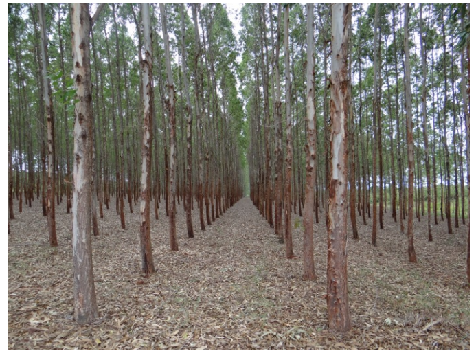
Photograph 15: Suzano's saplings at experimental eucalyptus plantation at the State Institute in Pernambuco. Ivonete Gonçalves de Souza

The imperative to reduce costs also explains Suzano's keenness to invest in the development of genetically engineered (GE) eucalyptus trees, or "supertrees" with even higher productivity. This involves increasing the amount of lignin in the wood and decreasing the amount of cellulose. Lignin and cellulose are the two basic components of wood and lignin has a higher calorific value, i.e. burning wood with more lignin generates more energy. Genetic engineering could also make eucalyptus resistant to glyphosate, a widely-used herbicide on plantations. This would accelerate production cycles further, which are already