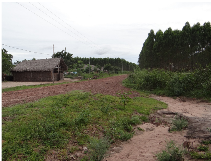
Photograph 6: Village of Tabocas fenced in by eucalyptus. Ivonete Gonçalves de Souza

In May 2009 Suzano tried to move into an area of highland plateau close to the communities of Coceira and Baixão da Coceira, where there was a high level of resistance against eucalyptus plantations. It was nine o'clock in the evening when a resident noticed company tractors on the plateau. Slowly, near-by communities were told what was happening and the next morning residents stood in front of the tractors to stop the forest from being cleared until the machine operators left. Later on, a Suzano manager called Sr. Demerval tried to meet with a community leader outside of the area to resolve the situation, but the community leader insisted that the meeting take place in the community. Many families in the area arrived to meet Sr. Demerval as they had also been invited to the meeting by the community leader. Sr. Demerval said that Suzano would give 500 hectares to each community as well as establishing "campo agrícola" ("mechanised