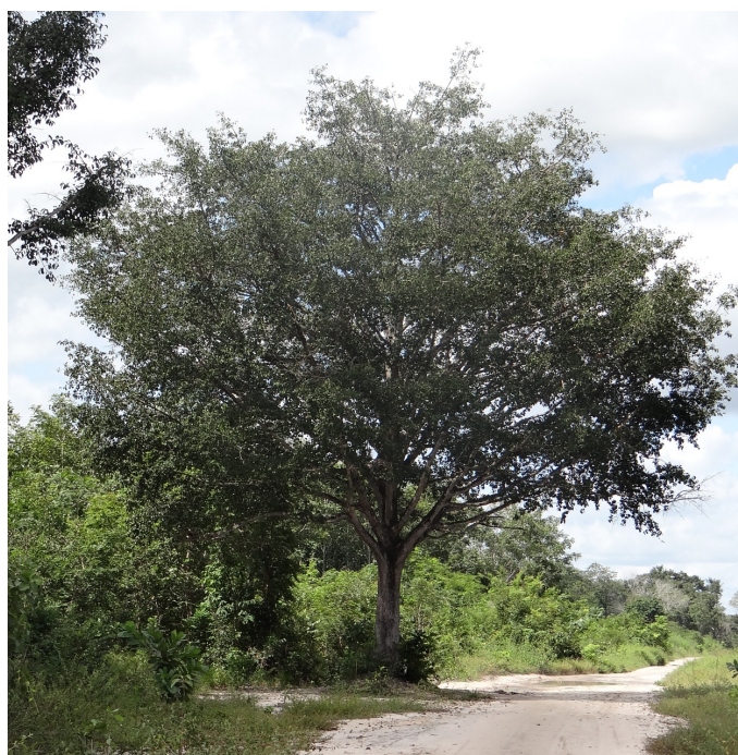
Photograph 1: Bacuri tree in the community of Santana. Ivonete Gonçalves de Souza

This report is dedicated to the communities [4] that have bravely resisted the attempts by Suzano to appropriate their lands and destroy extensive areas of Cerrado-covered highlands.