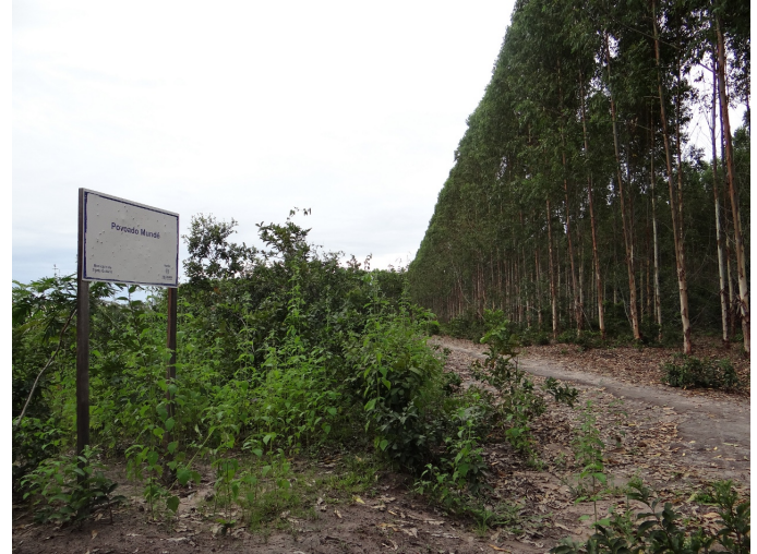
Photograph 4: Community fenced by eucalyptus plantation, village of Mundé. Ivonete Gonçalves de Souza