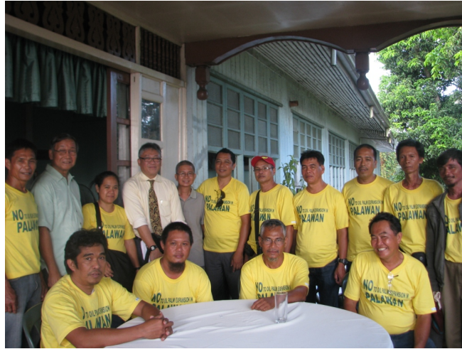
Members of the Palawan Campaign Against Land Grabbing

After the camp, participants issued a press release “Indigenous Peoples Unite to Stop Genetically Engineered Trees” “GE Trees: Another Form of Colonisation”