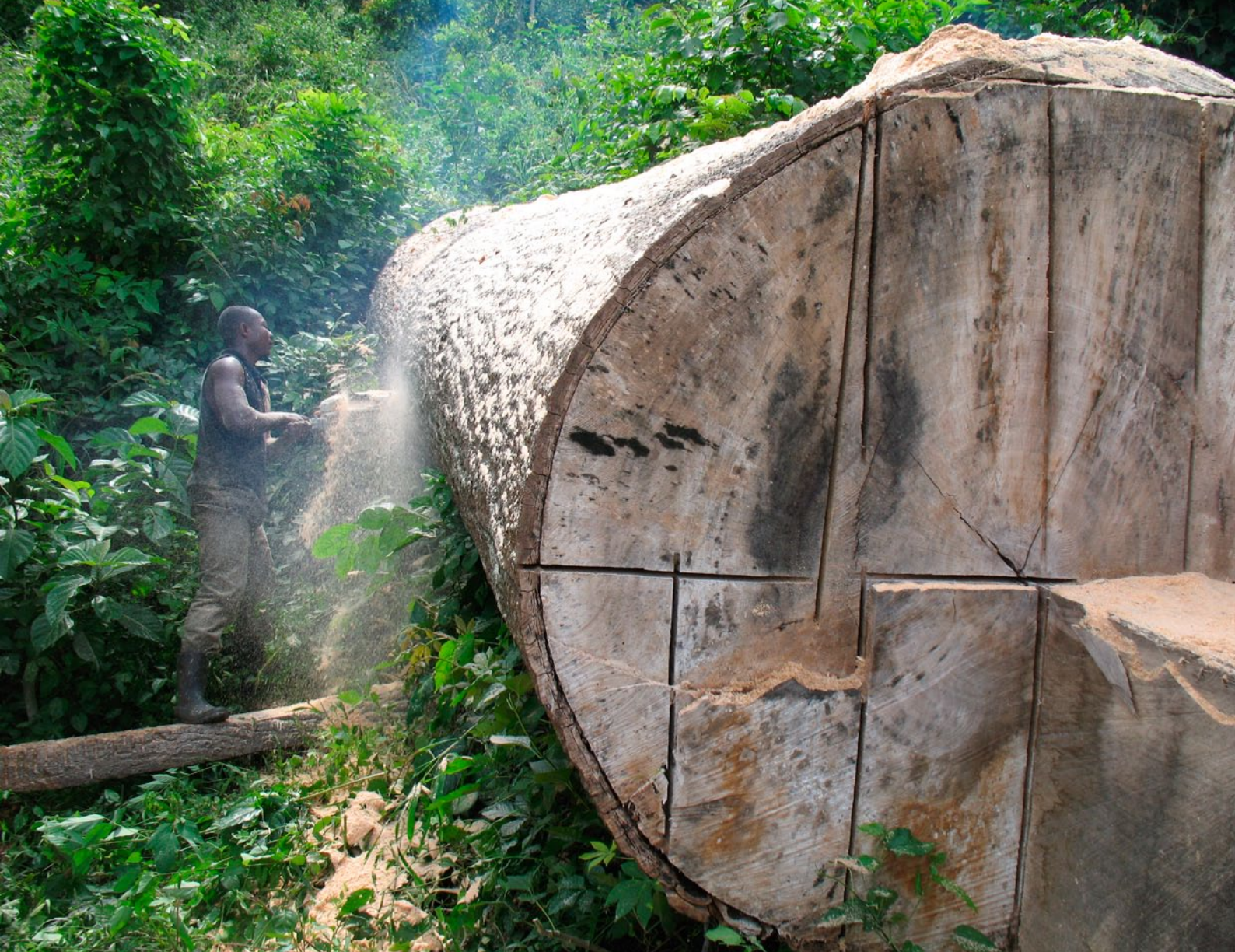
Ghana chainsaw millers at work: Respecting rights of farmers to land and trees in Ghana is essential to address Ghana's forest crisis.