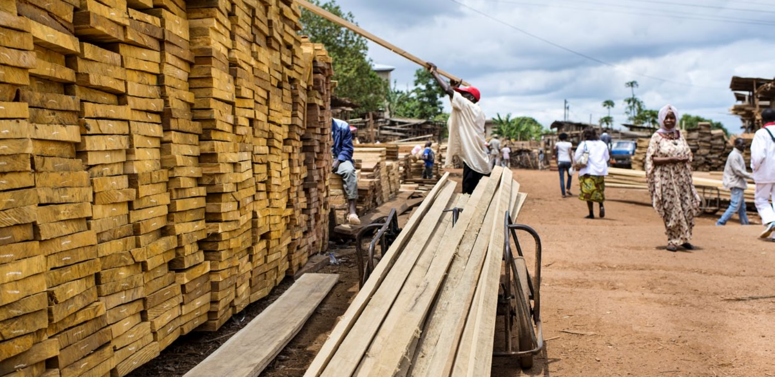
Small and medium enterprises will have to benefit from VPAS. Montée Parc Market, Yaoundé, Cameroon.