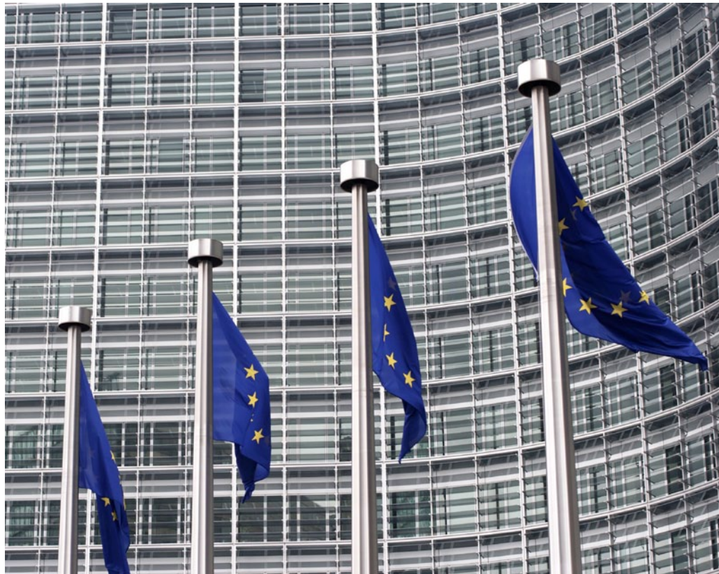
The European Union sees itself as a world leader on environmental issues.

But how will the EU's 'zero deforestation' target be achieved? The traditional method is conservation. Europe has long offered developing countries rewards for protecting their forests, most recently through the mechanism known as Reducing Emissions from Deforestation and Forest Degradation (REDD), which aims to cut carbon emissions by