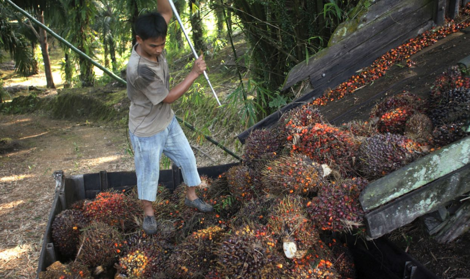
A worker loading oil palm fruit onto a truck in Sabah, Malaysia. Palm oil production has led to massive forest loss and rights violations in Southeast Asia and production is now moving to Africa.