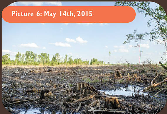
Picture 6: Documents a clearcut at Enviva logging site showing evidence of clearcut wetland forests