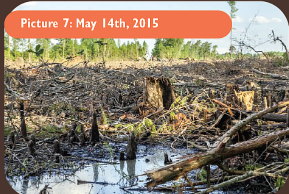
Picture 7: Further documents the clearcutting of wetland forests at Enviva logging site just outside Woodland, NC