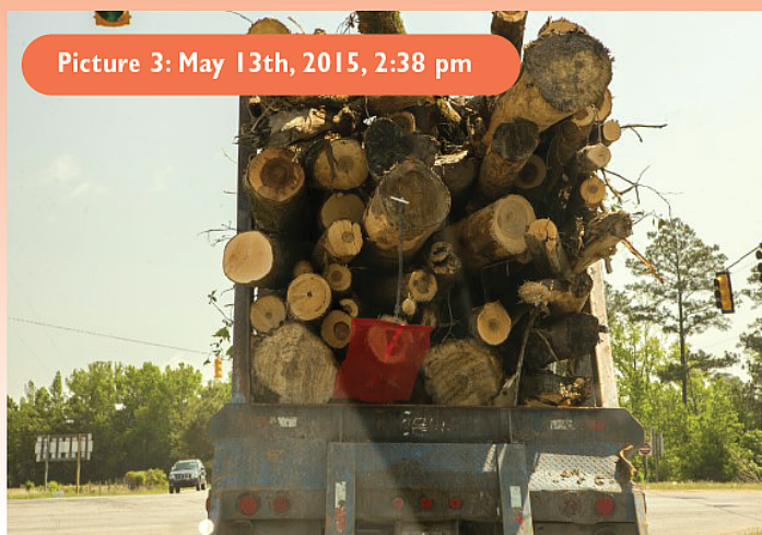
Picture 3: Further documents the route of the marked truck and clearly shows the size of the harvested hardwood timber.