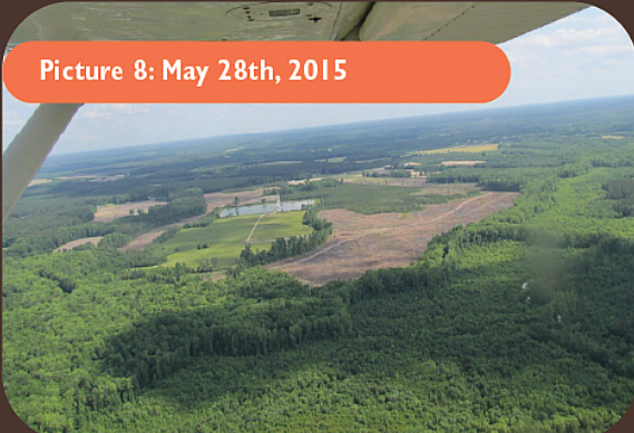
Picture 8: Aerial view of the logging site identified on May 13th.