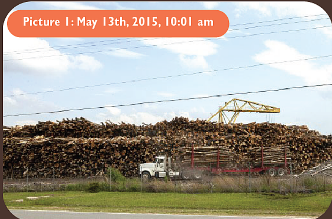
Picture 1: A logging truck entering the Enviva Facility and documents piles of large trees