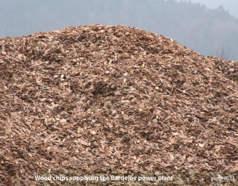
Wood chips supplying the Bardejov power plant