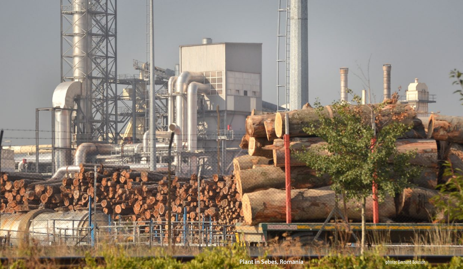
Plant in Sebes, Romania