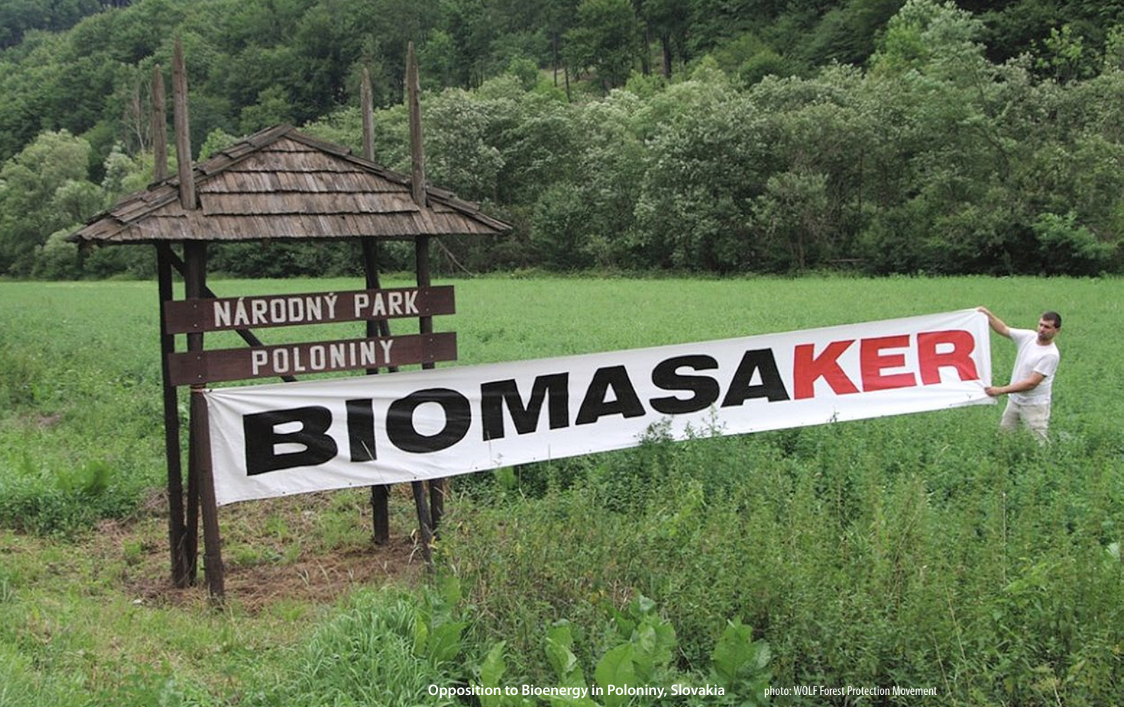
Opposition to Bioenergy in Poloniny, Slovakia