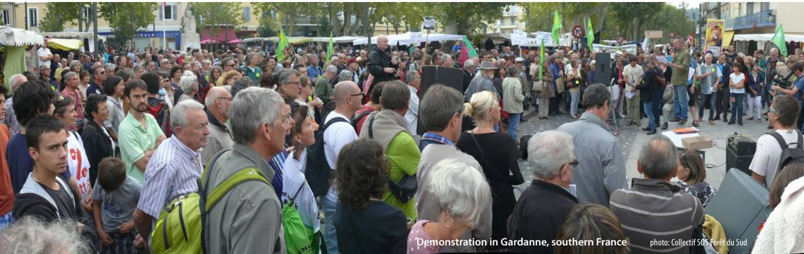
Demonstration in Gardanne, southern France

Gardanne, near Marseilles in southern France, is a small town with a large power station. The Centrale Thermique de Provence has the tallest chimney in France. At 300 metres high, it is only just shorter than the Eiffel Tower and dominates the town. From early 2016, the former coal-burning station will start burning wood chips.