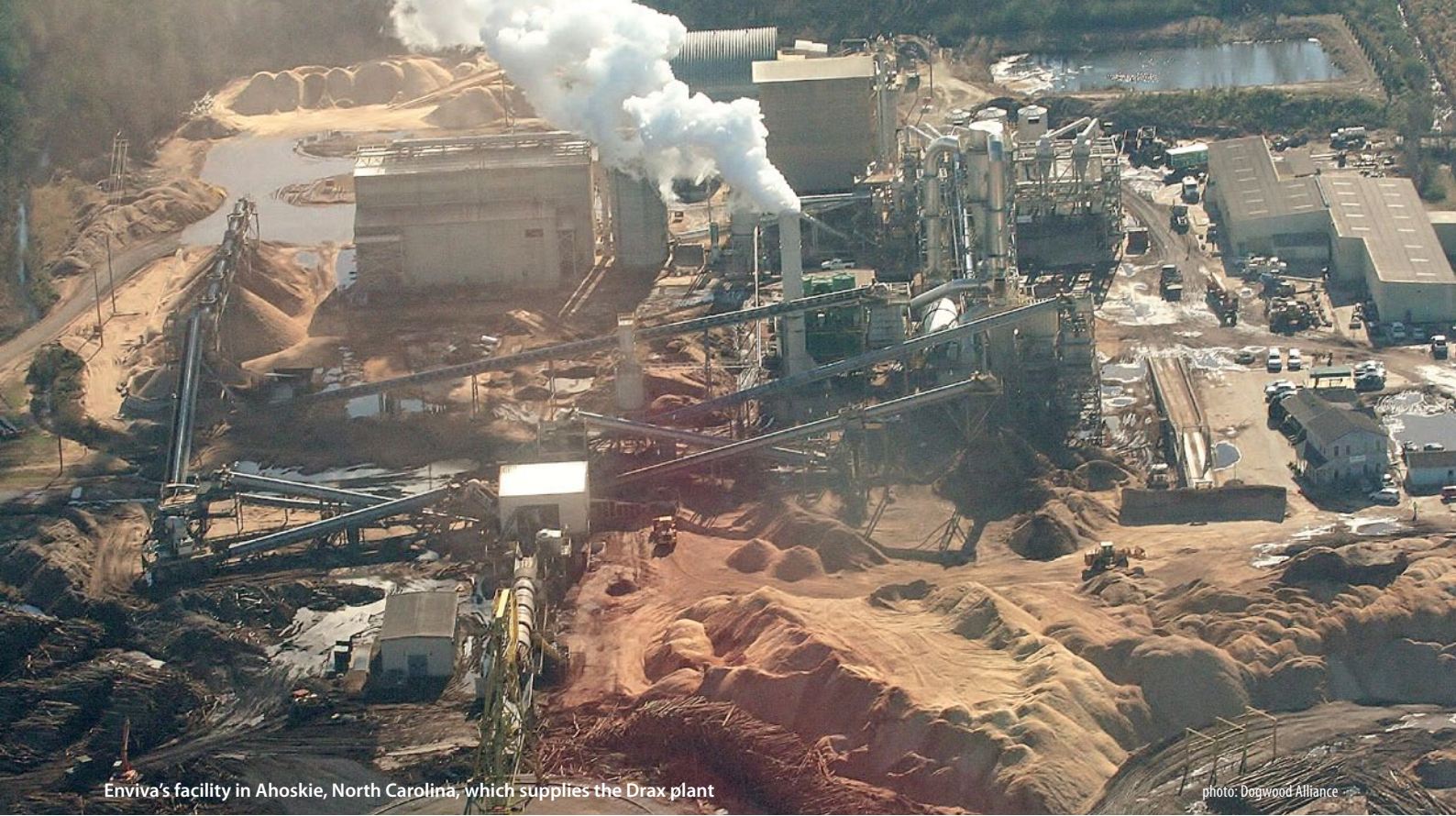
Enviva's facility in Ahoskie, North Carolina, which supplies the Drax plant