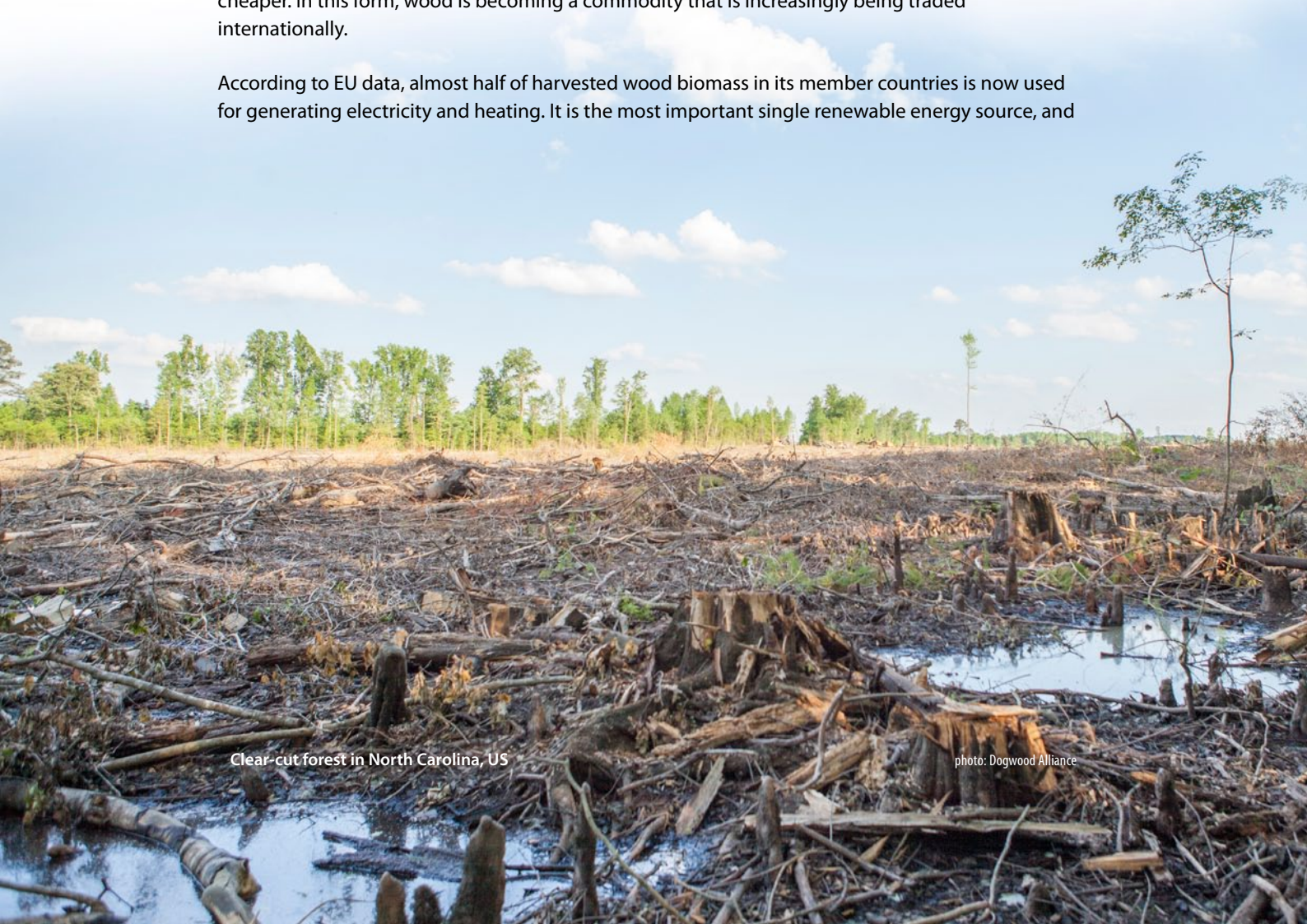
Clear-cut forest in North Carolina, US

According to EU data, almost half of harvested wood biomass in its member countries is now used for generating electricity and heating. It is the most important single renewable energy source, and