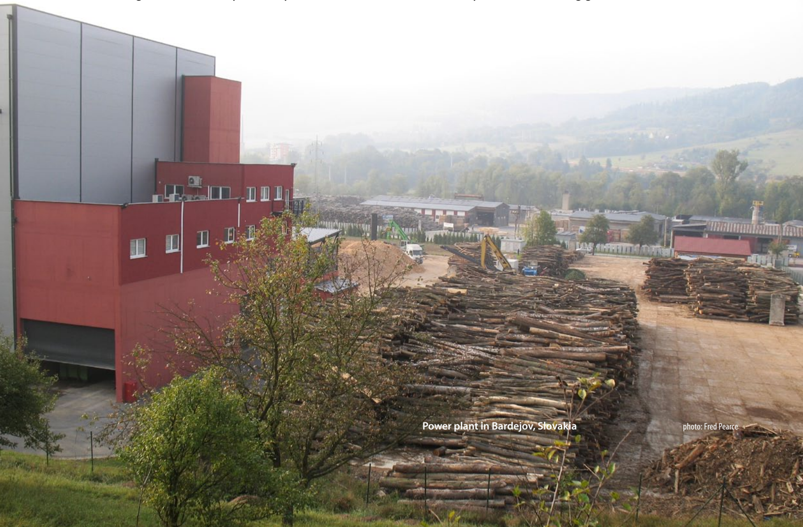
Power plant in Bardejov, Slovakia

A grassroots NGO called WOLF, which campaigns to protect Slovakia's forests and their large populations of wolves, bears, bison and lynx, calculates using government statistics that ten