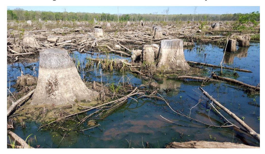
Photo: Logging site from which Enviva pellets have been sourced, North Carolina, Dogwood Alliance

All pellet mills operated by Enviva, with whom MGT Teesside has signed a supply agreement for around 1 million tonnes a year, are based in the North Atlantic Coastal Plain region. This area was declared a global biodiversity hotspot in 2016 and contains some of the most biodiverse temperate forest and freshwater ecosystems in the world. Enviva's own data shows that at least half of the wood it sources is obtained from hardwood forests, much of it from wetland forests<sup>12</sup>. Hardwood from the region comes entirely