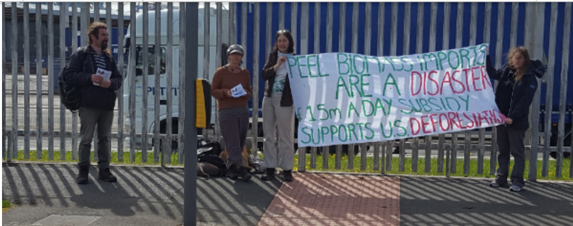
#AxeDrax demonstration at Peel Port, Liverpool, April 2018