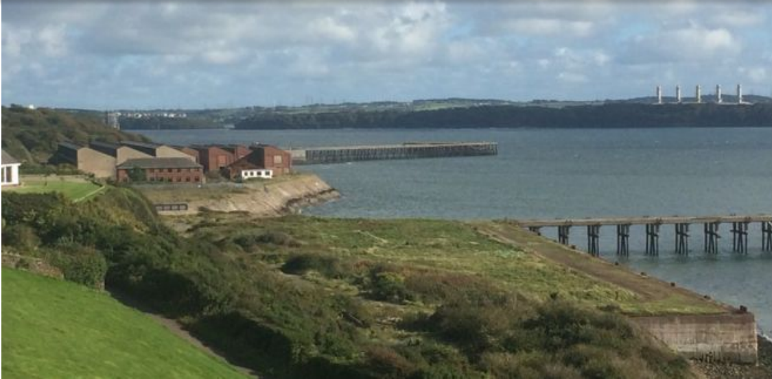
Milford Haven, where there isn't a waste and wood gasifier