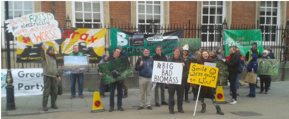
#AxeDrax AGM demonstration, York, April 2018