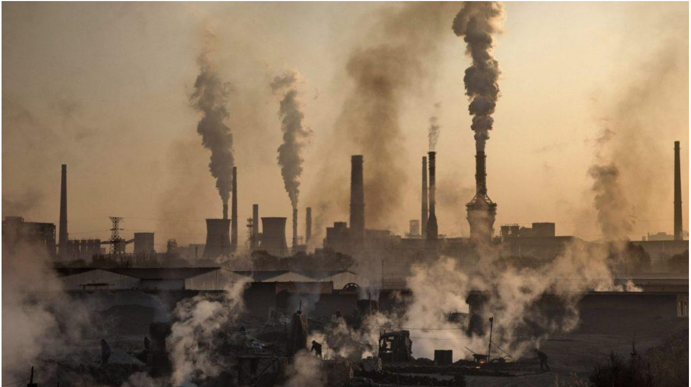
Image 8: If Turkenburg, Faaij and Junginger would be living near a biomass power plant the world would probably be a different place.

Quote from 2017 from Martin Junginger: We are currently sourcing a lot of wood to replace coal from pine tree plantations in the southeastern US. However, these plantations are not or hardly FSC certified because the local paper industry does not value this. This can of course change, but it takes a lot of time. Moreover, bioenergy is ultimately not the main market for this wood. That is why the motivation for landowners to certify their forest will remain limited.