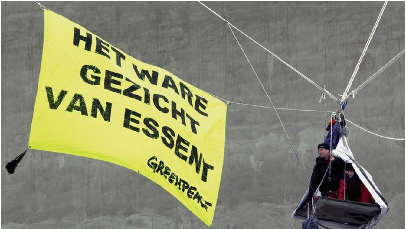
Figure 13: Greenpeace protest against the Essent power stations (2011/2012)

RWE / Essent top officials have lobbied heavily in the following years and ultimately ensured that their plans were incorporated into the Energy Agreement . This was possible thanks to the support of Minister Cramer and the reports from the Copernicus Institute .