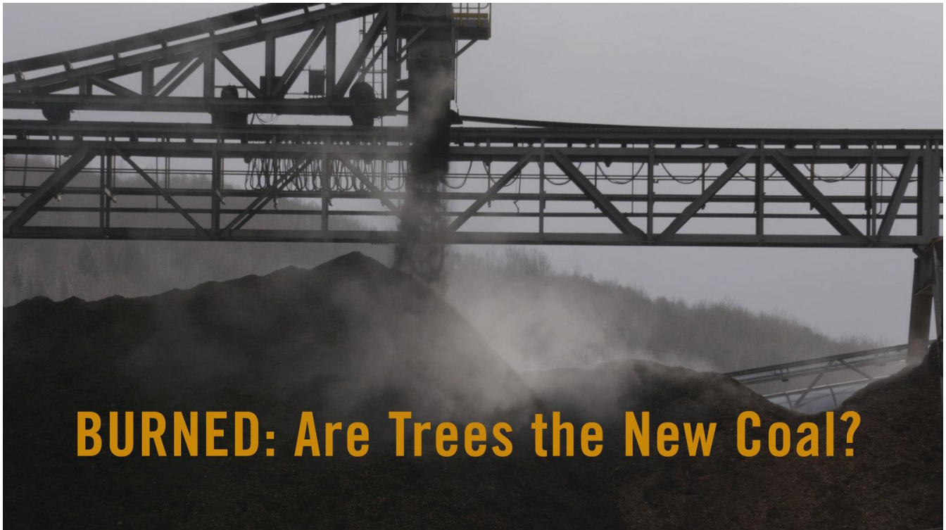
Image 5: BURNED: Are Trees the New Coal? A documentary about the national and international biomass controversy

In 2002, the Copernicus Institute started the FAIR Biotrade project of Essent (RWE) to convert the Essent Green Gold Label (GGL) into a certification system (SBP) for the worldwide trade in biomass. Essent (RWE) has been burning woody biomass at the Cuijk power plant since 1999, expanded it extensively to the Amer power plant in 2001 and has been making woody biomass a global trading product at a rapid pace.