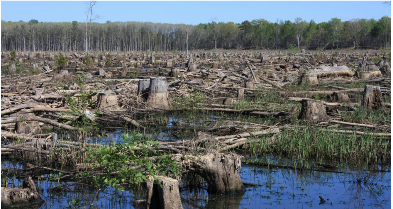
Image 6: forest logged for RWE Essent wood chip factory in Georgia (United States) for the production of woodchips for biomass burning