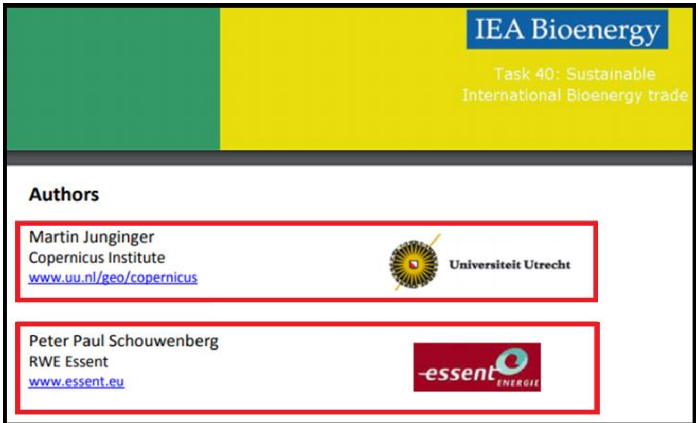
Image 11: The authors' names are stated at the top of many paid pro-biomass lobby reports from the Utrecht University and RWE Essent