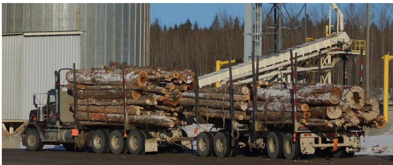
Figure 3. Old growth cedar logs arriving at the Pacific Bioenergy pellet plant in Prince George, British Columbia.

Additionally, there is nothing in the RED that protects any particular forest from being harvested, even the most carbon rich and biodiverse, and there is no prohibition on the most damaging forestry practices. This means we will continue to see egregious forest exploitation by the biomass and wood pellet industry including logging in wetland hardwood forests of the US Southeast, 8 clearcutting of boreal forests in Estonia, 9 illegal logging in Romania’s Carpathian Mountains to make pellets for residential heating, 10 and recently, logging old-growth in British Columbia’s inland rainforest 11 (Figure 2). The RED’s “sustainability” criteria do not require even minimum protections, let alone mandating sustainable forestry practices like retaining forestry residues to protect soil nutrient status, which a major survey identified as at risk from biomass harvesting. 12