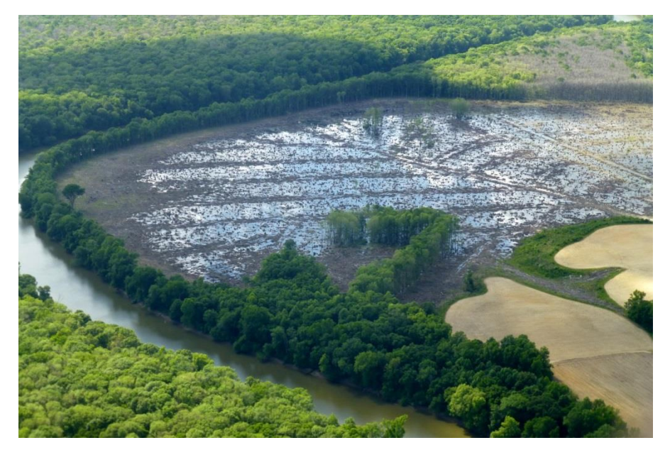
Figure ES-1. Picture from a Washington Post article,<sup>1</sup> showing an area where trees were harvested and sold to Enviva for pellet manufacture. The paper's caption reads, " Little remains but stumps and puddles in what was once a bottomland hardwood forest on the banks of the Roanoke River in northeastern North Carolina. Many of the trees were turned into wood pellets for burning in power plants in Europe. Others were sold for high-value uses such as furniture." (Joby Warrick/The Washington Post).

Biomass power generation – the combustion of wood, agricultural residues, and other biological materials as fuel in electrical generating plants – has increased significantly in the EU and UK in recent years, driven by the eligibility of bioenergy to meet mandated renewable energy targets and generous renewable subsidies available for renewable technologies. However, emerging demand for biomass is too large to be met with local sources, thus power companies in the EU and UK import millions of tons of biomass each year, a large proportion as wood pellets from a new and fast-growing wood pellet industry in North America. The growth in international biomass supply and consumption has been controversial, however. Unlike wind and solar energy, burning biomass emits carbon dioxide, a major greenhouse gas, and in fact, burning wood and other biomass fuels actually increases the amount of carbon dioxide that a power plant emits per megawatt-hour of electricity generated, compared to burning coal or gas. Treatment of biomass power as a renewable energy technology worthy of subsidization has been based in part on a carbon-counting protocol in the EU and UK that ignores these stack emissions and the considerable time-lag that exists between emissions and their eventual offsetting through new forest growth, and the lack of any institutional or legal mechanism for determining whether forest regrowth is actually sufficient to offset emissions.