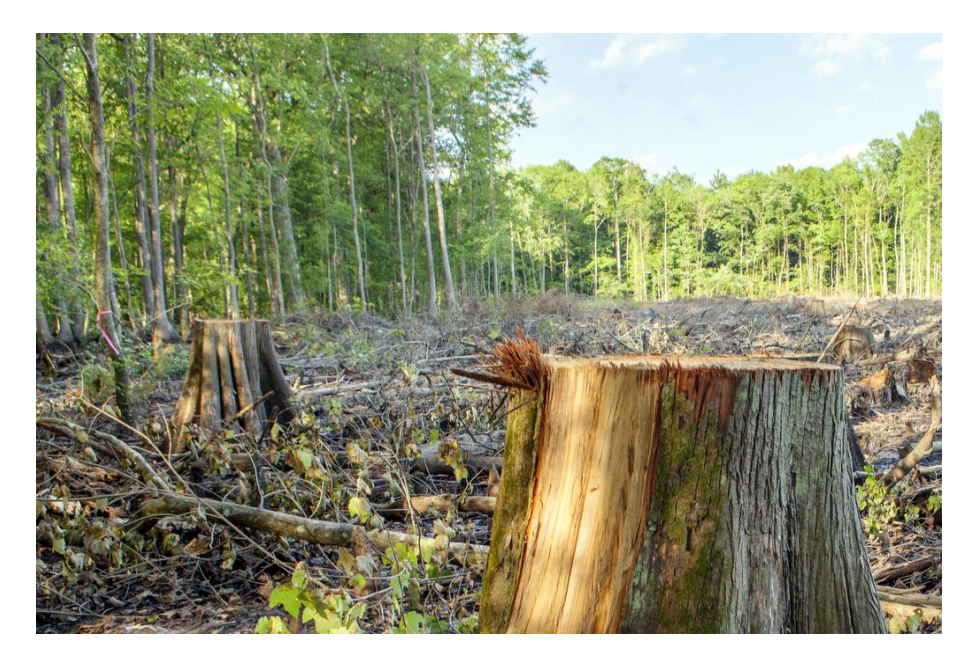
Figure 6. Stumps at the Urahaw Swamp in Woodland, NC, which was harvested in May, 2015. The stumps are Bald Cypress Trees that were several decades to more than 100 years old. <sup>75</sup>

b) Similarly, almost none of the statements about materials sourcing in Enviva's prospectus acknowledge that "trees" are cut down for pellet feedstock, though the category may be implied in the phrase "low value wood materials that are generated in a harvest":