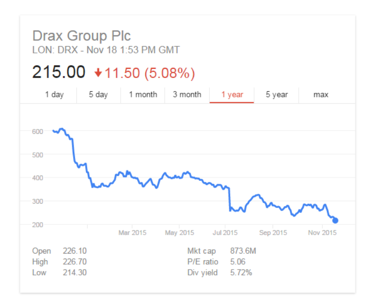
Figure 3. Drax share price November 18, 2014 – November 18, 2015.

fell again by more than a quarter in 2015 after analysts stated that the change in subsidies could significantly reduce the company's earnings in 2016 - 2017<sup>62</sup> (Figure 3).