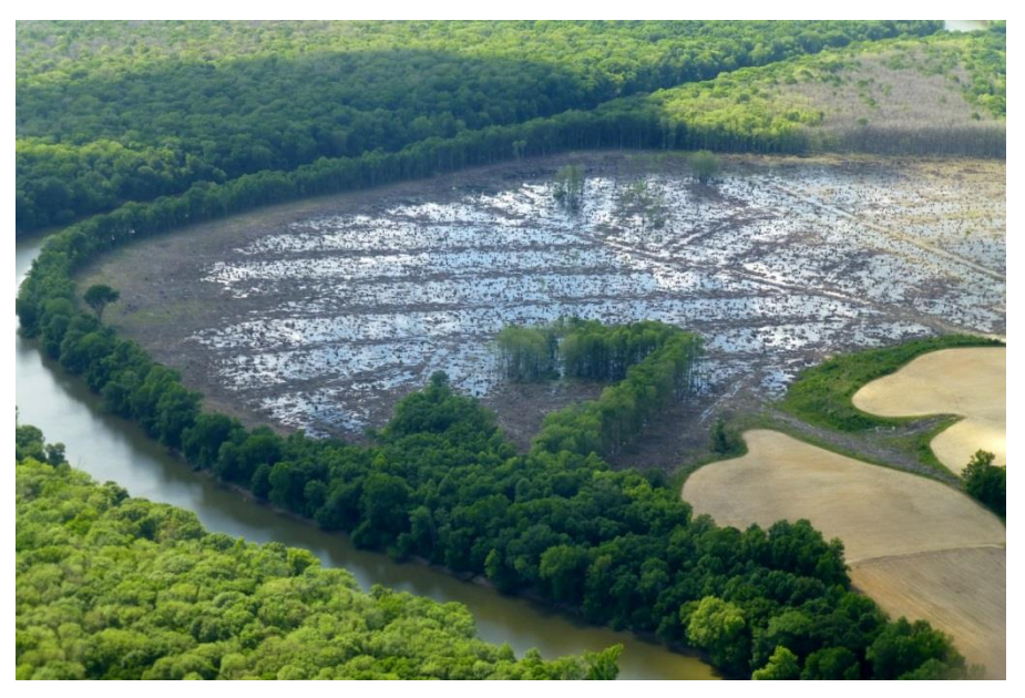
Figure 8. Photo from a Washington Post article,<sup>87</sup> showing an area where trees were harvested and sold to Enviva. The paper's caption reads, "Little remains but stumps and puddles in what was once a bottomland hardwood forest on the banks of the Roanoke River in northeastern North Carolina. Many of the trees were turned into wood pellets for burning in power plants in Europe. Others were sold for high-value uses such as furniture."

custody" certifications that Enviva is actually talking about are not related to forest management, but to protocols for tracking sustainably harvested wood.<sup>86</sup>