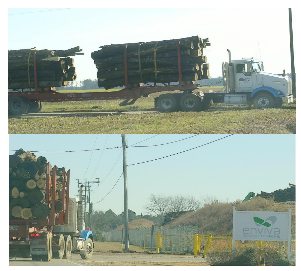
Figure 7. A wood truck leaving a harvest site; another truck entering the pellet plant.<sup>82</sup>

e) When Enviva does acknowledge in the prospectus that it cuts trees, it states they are "non-merchantable" or otherwise defective. However, these are the same materials that provide feedstock for the pulp and paper industry: